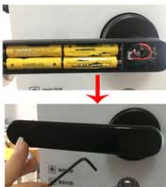
9. Put 4pcs AAA batteries into back handle and put cover on