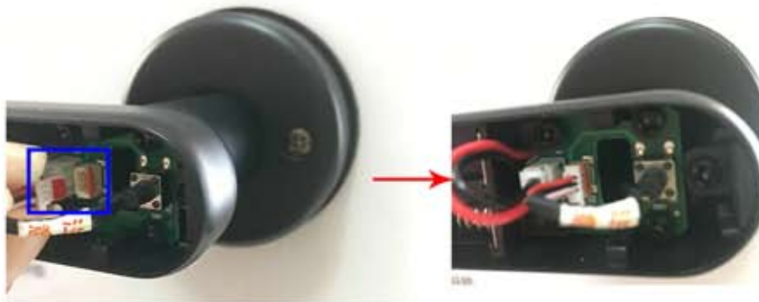
8. Plug wire from front handle into port on back handle, Red mark should be at same side