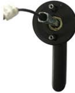
3. Get wire through the hole of square rod