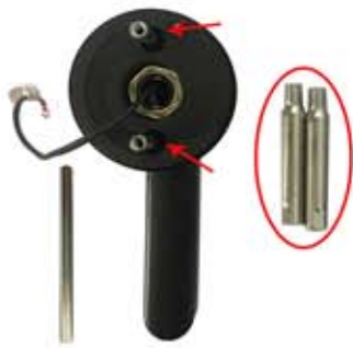
2. Put screws in circle onto front handle