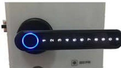
10. Test the lock and installation is done