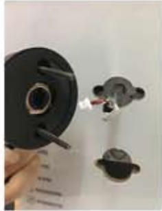
6. Put Fixing screws into back handle