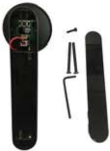
5. Screw off the cover on back handle